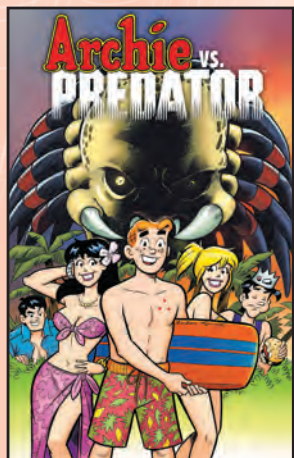
ARCHIE VS. PREDATOR #1 DARK HORSE COMICS