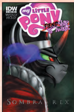
MY LITTLE PONY: FIENDSHIP IS MAGIC MINISERIES IDW PUBLISHING