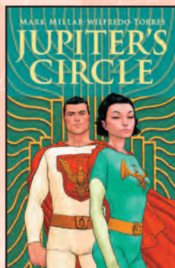
JUPITER'S CIRCLE #1 IMAGE COMICS