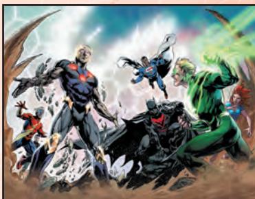
CONVERGENCE #1 DC COMICS