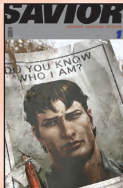
SAVIOR #1 IMAGE COMICS