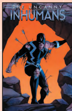
UNCANNY INHUMANS #0 MARVEL COMICS