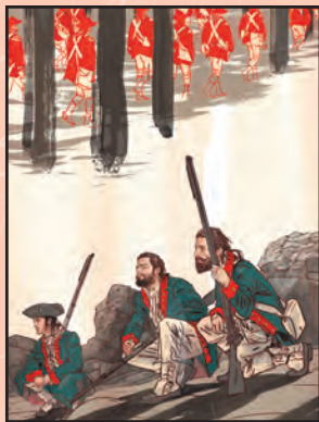
REBELS #1 DARK HORSE COMICS