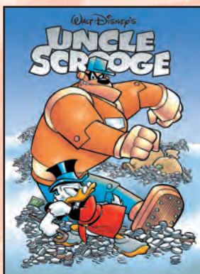
UNCLE SCROOGE #1 IDW PUBLISHING