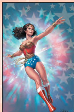
WONDER WOMAN '77 SPECIAL #1 DC COMICS